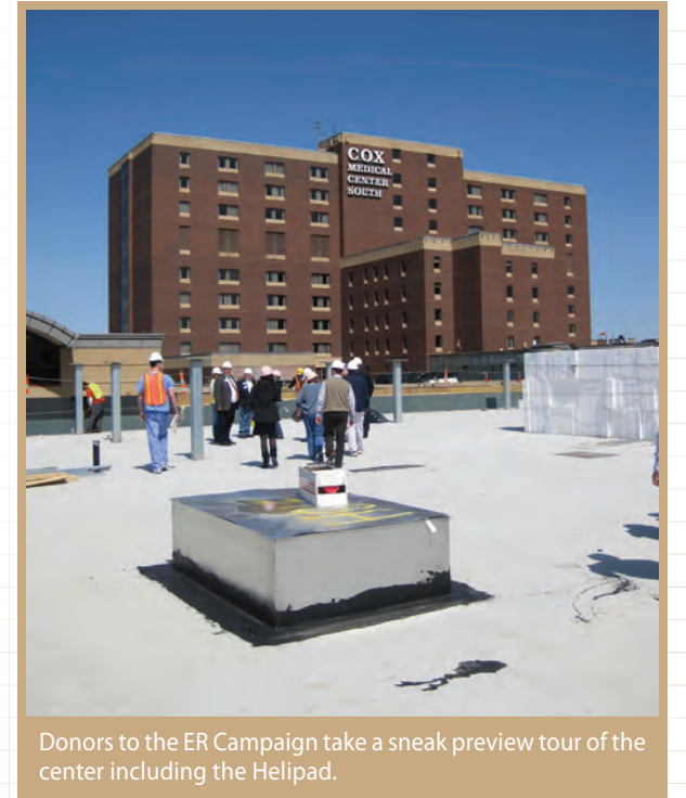
Donors to the ER Campaign take a sneak preview tour of the center including the Helipad.