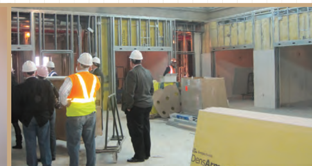
The patient care areas begin to take shape in one of the five pods in the new ER.