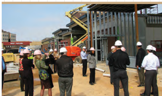
The entry to the ER begins to take shape.