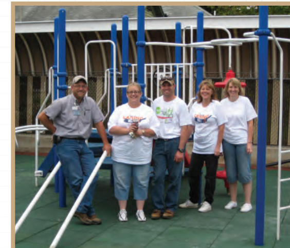
CoxHealth employees donated their time to lay rubber mat tiles for a new playground surface at the Cox North Learning Center. The recycled material tiles were provided through a grant from Missouri DNR.