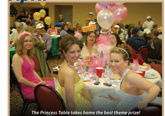
The Princess Table takes home the best theme prize!