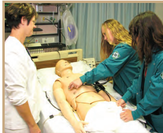
In 2009 Cox College received three human patient simulators thanks to the donations of alumni, individual donors and the Kerr Foundation.