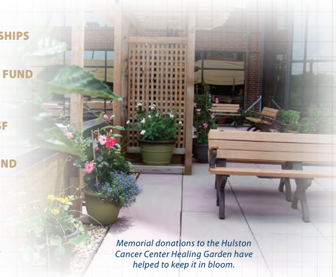
Memorial donations to the Hulston Cancer Center Healing Garden have helped to keep it in bloom.

To make a memorial or honorarium contribution, send your gift to: CoxHealth Foundation 3525 S. National, Ste 204 Springfield, MO 65807